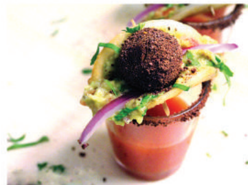
Savory Truffle Mini Taco Shooter